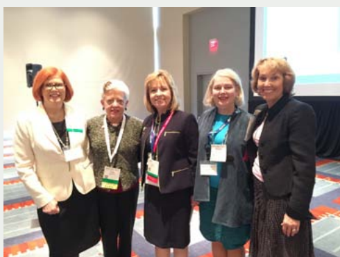
LHT Award Recipients

She has had a long standing commitment to AAWD. She has been a faculty mentor to the AAWD student chapters and both the University of Maryland College of Dentistry and NSU. She has served on the Gillette Hayden Foundation Advisory Board and as the Chair of Corporate Round Table and Seal of Approval. She also served on the AAWD Board.