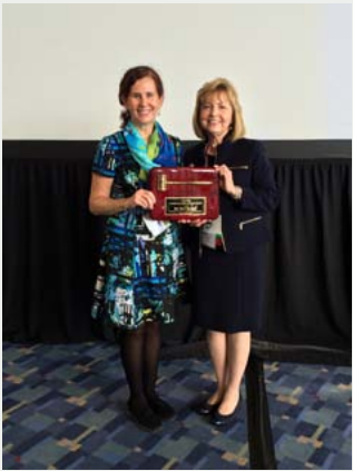
All the way from New Zealand!