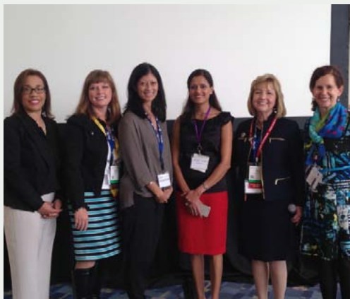
Installation of the 2016 Executive Board