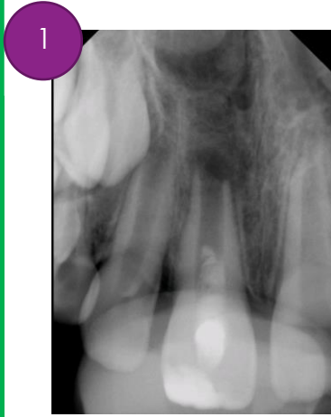
08/2015 – Nonhealing Apexogenesis