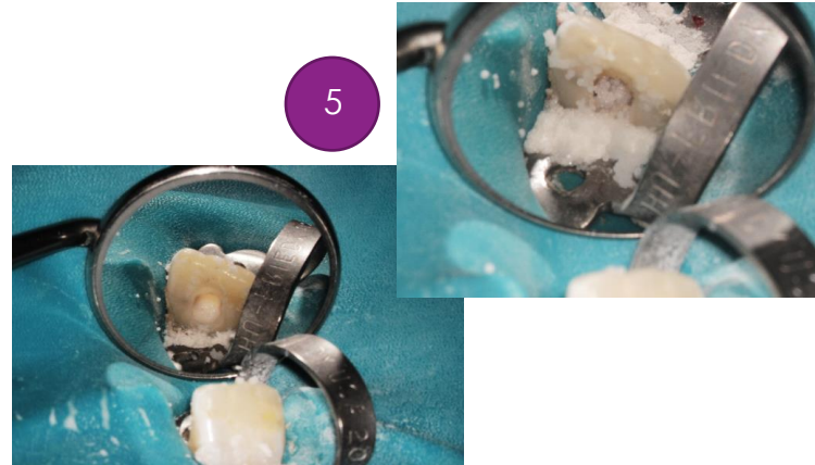
09/2017 – Internal bleaching technique