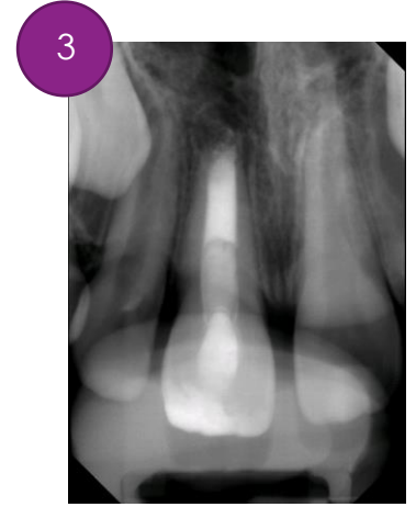
2016 – Healing