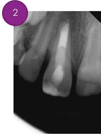
10/2015 – Apexification