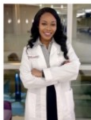
President, AAWD Meharry Chapter

The women panelists also offered expert advice on balancing work and family life, and shared stress management ideas. All of the women were transparent and candid when sharing their personal stories. All of the symposium speakers offered ways to "secure the bag" and go after what you want in life. It was definitely a phenomenal symposium. The student doctors of AAWD did an awesome job in organizing this year's symposium. I am confident next year's symposium will be just as, if not more, informative and enlightening.