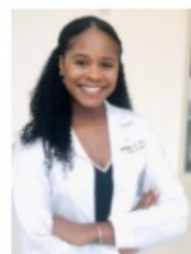
Vice President, AAWD Meharry Chapter