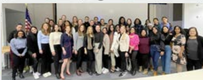
AAWD Meet & Mingle, The Boston Tri-School Network Event