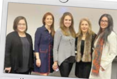
HSDM, BSDM, and TUSDM AAWD Faculty Advisors